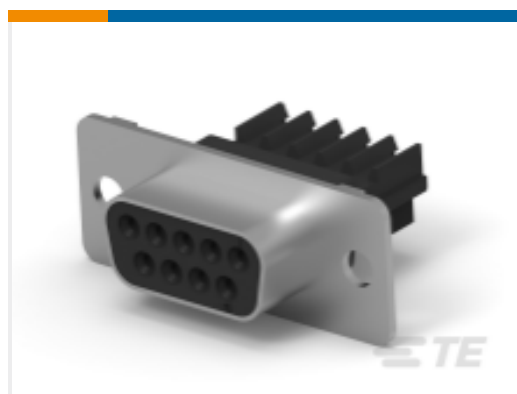
TE Part # CAT-AM7-248H8 IDC D-Sub: Receptacle Assembly, Wire to Wire, Signal, 2.74 mm